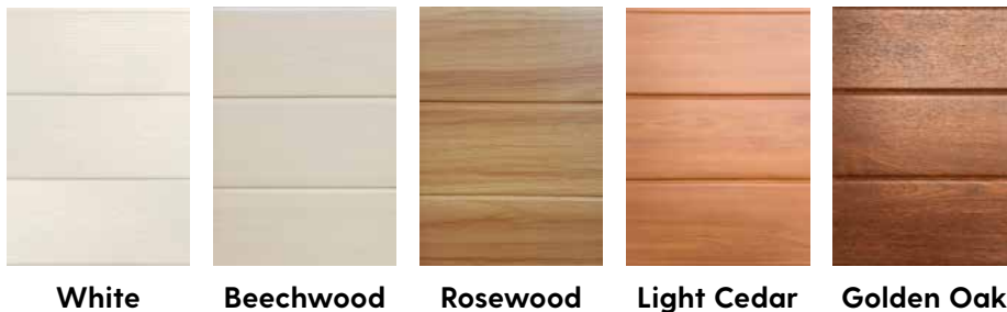
NOTE: Colours shown for illustration only.

The Capri high-density uPVC lining is the perfect alternative to traditional timber lining for both indoors and out-of-weather applications. The product is sustainably sourced from 95% recycled uPVC, with no harmful materials. Capri is non-toxic, non-caustic, contains no wood filler, and is extremely lightweight, durable and long lasting. When choosing Capri lining, you get the natural look of wood, in a prefinished, durable material with almost no maintenance. Quick and easy to install, Capri lining comes in 5 colours with matching trims.