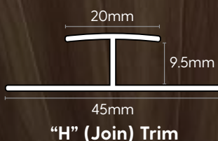
"H" (Join) Trim