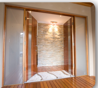
M&B SubFrame is an inexpensive solution to a potentially costly problem.

Minimise the risk of damage to your timber door frames during construction. An M&B Sub Frame will ensure the frame opening is true and square, designed to trim fit final frames and doors.