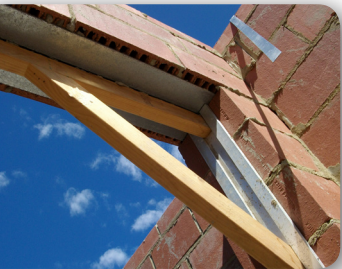
Provides an accurate straight edge for the plasterer to return render to.