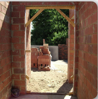
Once brick work is dry, timber braces can be removed [sawn] to allow for easy access.