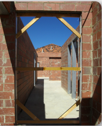
Quick & simple to install. M&B SubFrame is "bricked in" to ensure opening is true & square to fit final frames and doors.

innovative solution for the perfect door system