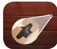
Deck-Max Secret Fixing

Edeck is an engineered Jarrah decking from Western Australia which is guaranteed to give superior strength and stability. This premium decking comes pre-oiled to reduce moisture uptake and is available pre-profiled for secret fixings. Edeck is manufactured by value adding wood waste and shorts producing an environmentally friendly premium product. Jarrah is a quality decking medium as well as being one of the hardest and most durable timbers available.