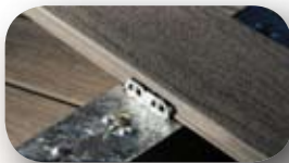
Klevaklip Secret Fixing

Alternative fixing methods are also available. For further details please visit www.mbsales.com.au