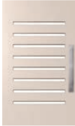
PSLM PV 208