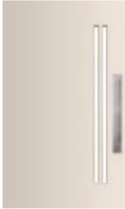
PSLM PV 202