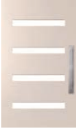
PMAD PV 104