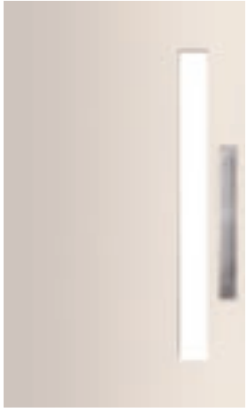
PMAD PV 101