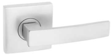
ANGULAR DUMMY SQUARE LEVER PICTURED FINISH Satin Chrome PART NUMBER 1820ANG