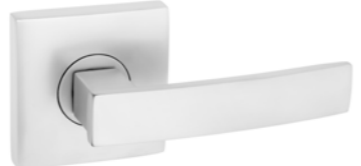
ANGULAR PASSAGE SQUARE LEVERSET PICTURED FINISH Satin Chrome PART NUMBER 1805ANG (Visual Pack) 1800ANG (Trade Pack - latch sold separately)