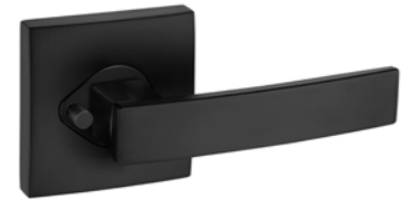
ANGULAR PRIVACY SQUARE LEVERSET PICTURED FINISH All Matt Black PART NUMBER 1815ANG (Visual Pack) 1810ANG (Trade Pack)