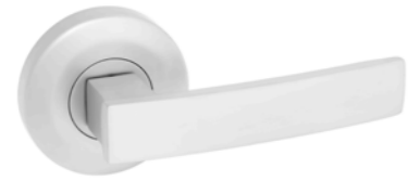
ANGULAR PASSAGE ROUND LEVERSET PICTURED FINISH Satin Chrome PART NUMBER 1905ANG (Visual Pack) 1900ANG (Trade Pack - latch sold separately)