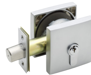
SMOOTH SQUARE DEADBOLT DOUBLE CYLINDER PICTURED FINISH Satin Chrome PART NUMBER 1851SM AVAILABLE FINISHES SC, MB, BC.