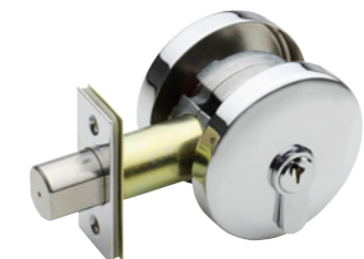
SMOOTH ROUND DEADBOLT SINGLE CYLINDER PICTURED FINISH Bright Chrome PART NUMBER 1946SM AVAILABLE FINISHES SC, MB, BC.