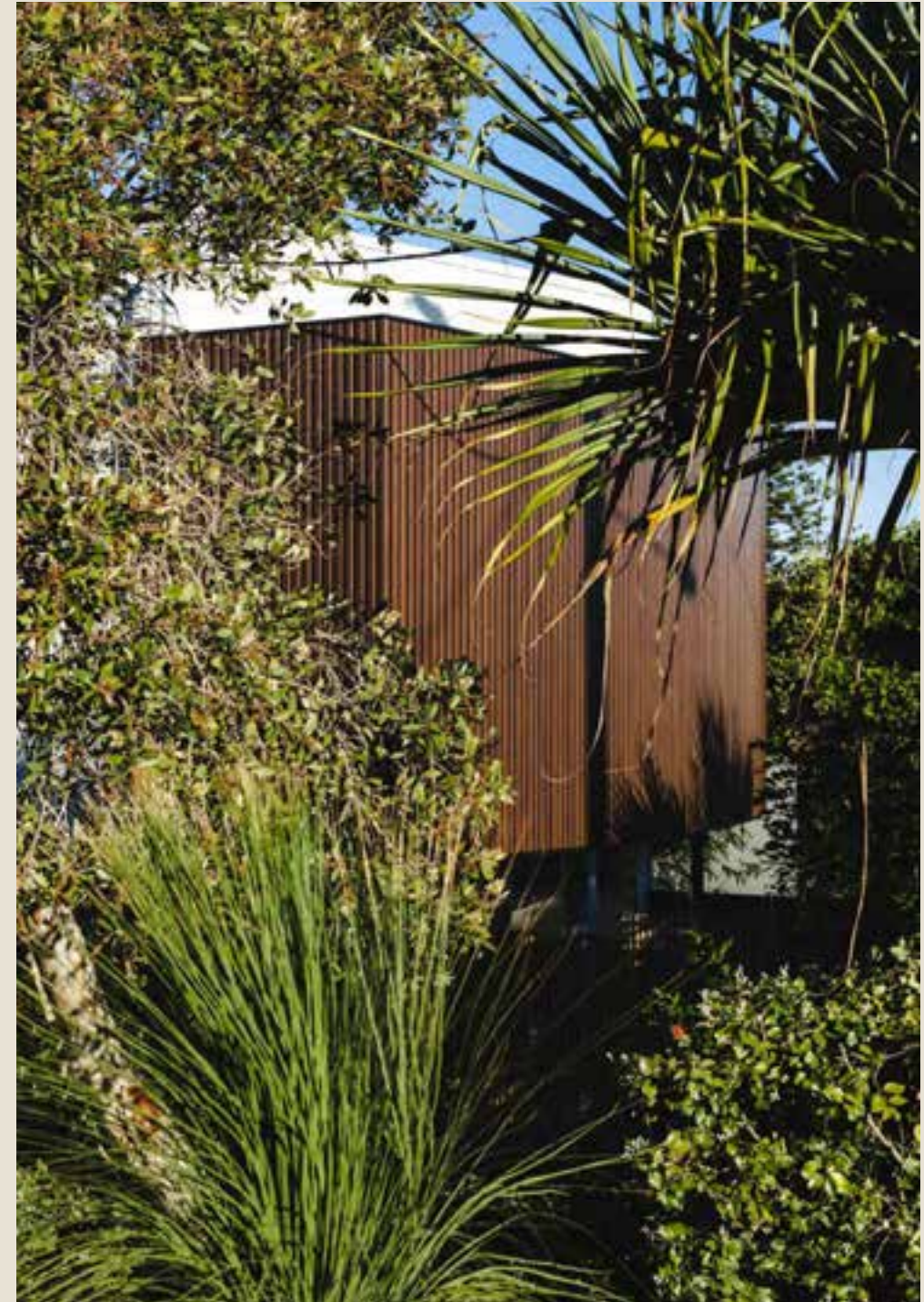
Colour: Teak Brown Designer: Adoda Design Group Builder: Menzie Designer Homes