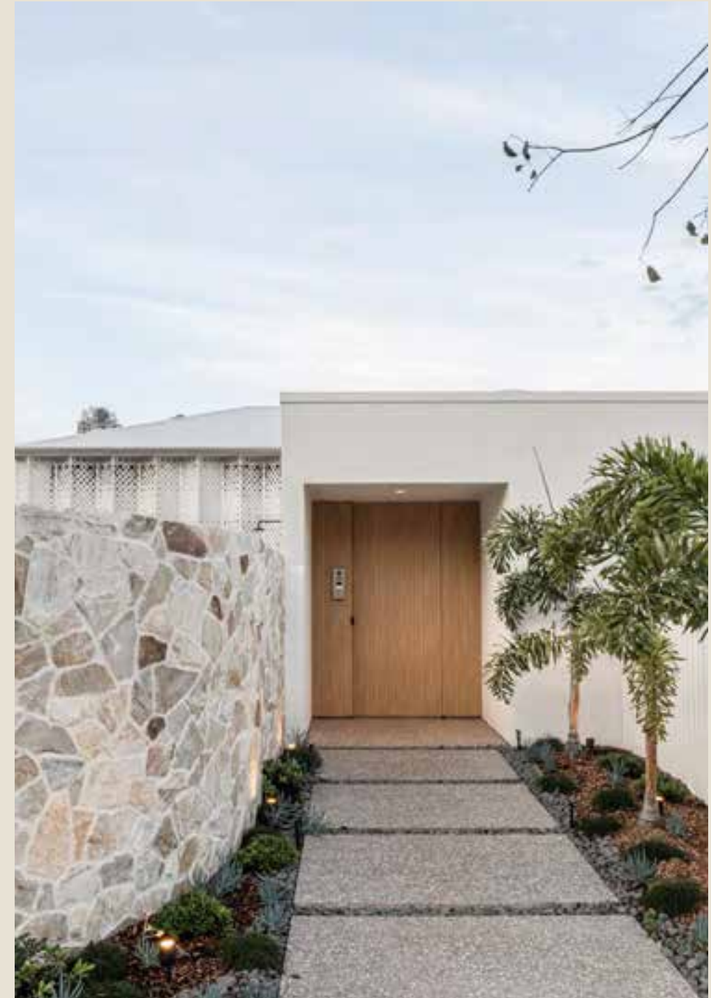
Colour: Silver Wattle Architect: Reece Keil Design Builder: Bespoke Projects