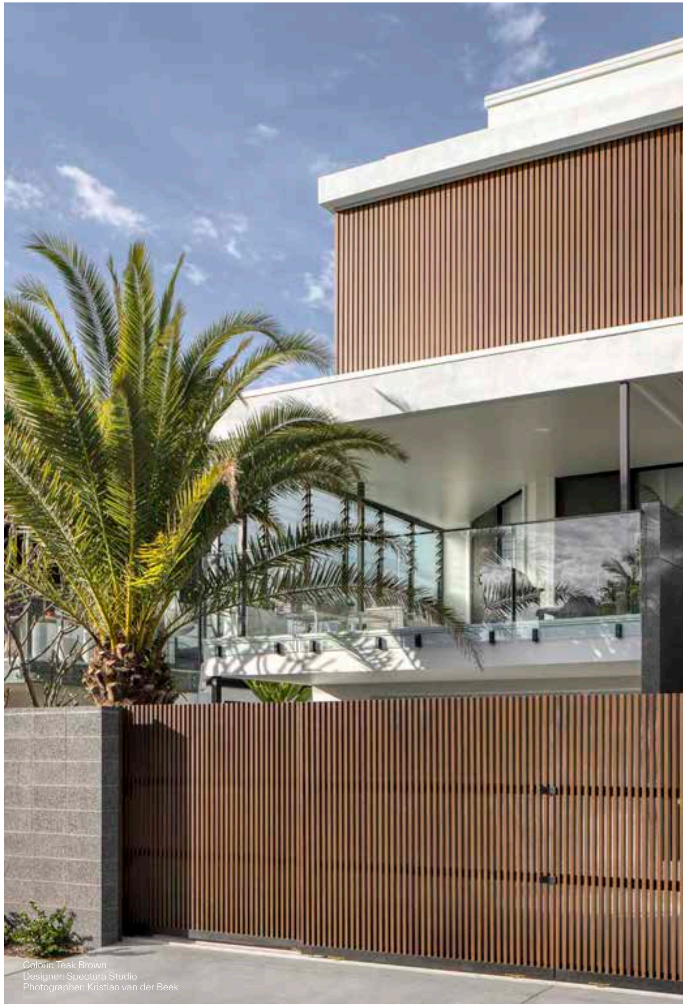
Colour: Teak Brown Designer: Spectura Studio