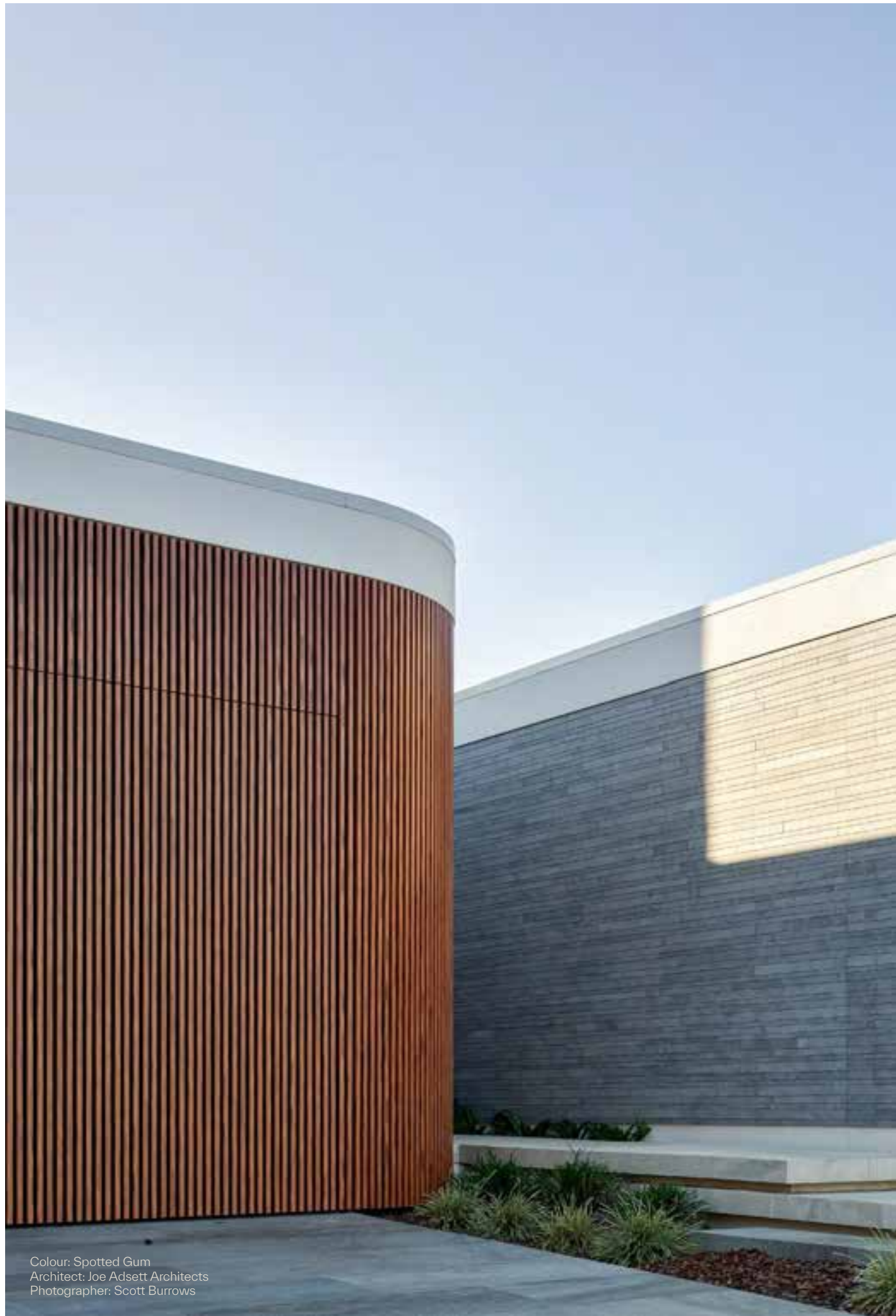
Colour: Spotted Gum Architect: Joe Adsett Architects